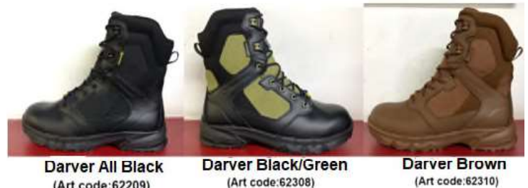
Darver All Black (Art code:62209)